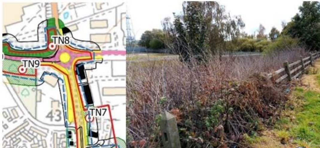
Figure I2: Location (TN7) and photograph of Japanese knotweed within Order Limits